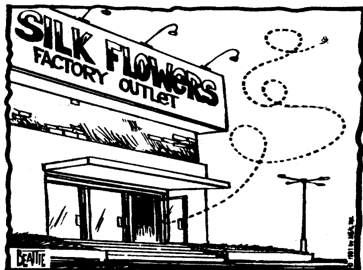
The world's most confused honeybee