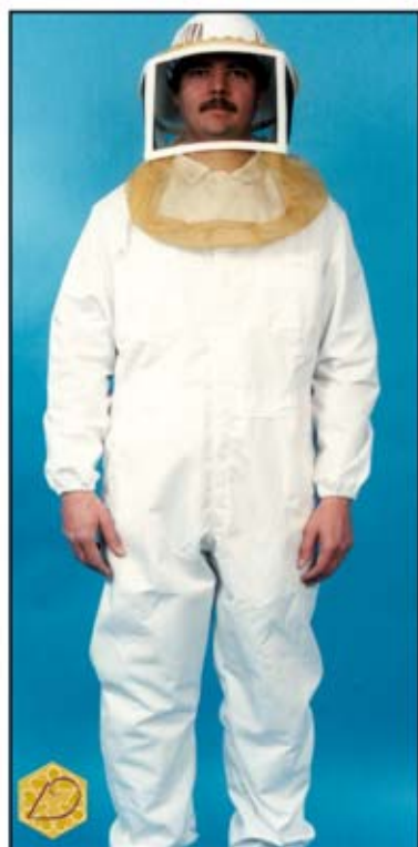
Dadant Zipper Veil Suit